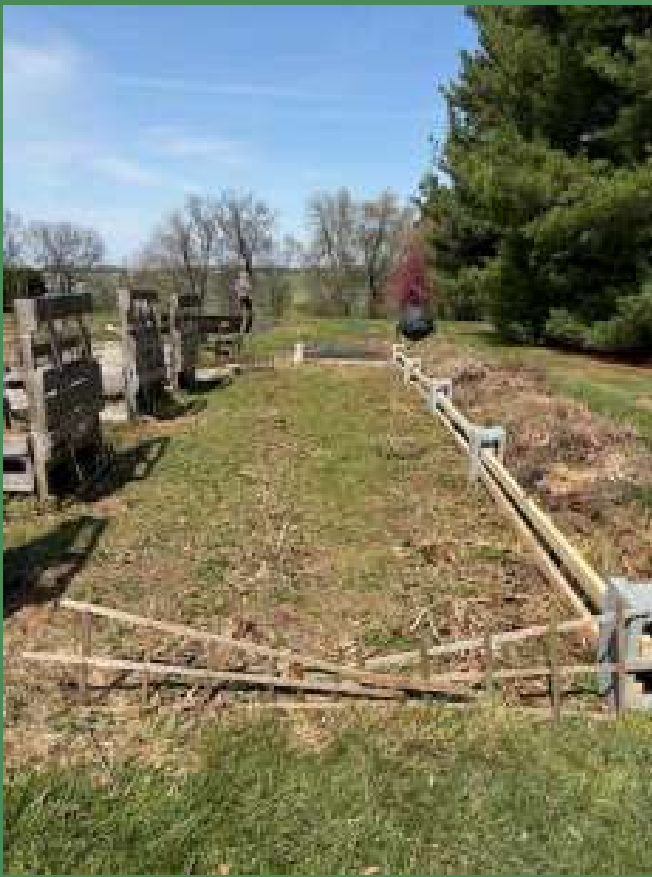
Florin Garden asparagus plot. Looking forward to cutting fresh asparagus this spring.