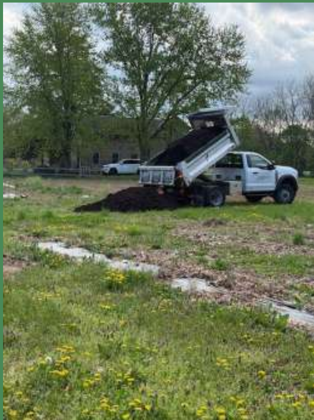
Look who came out to help us get the Donegal Presbyterian Garden ready for Spring planting. The Mount Joy Boro employees delivered compost for us to get the garden in shape.